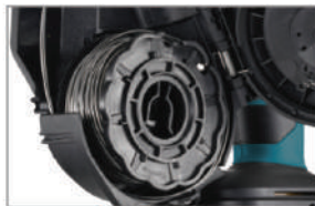
Large capacity reel, more durable